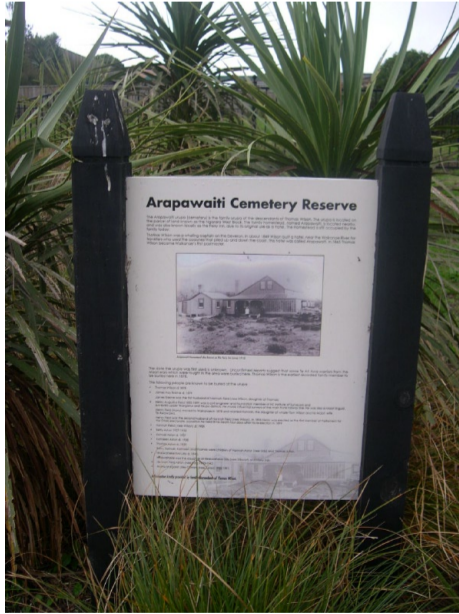
Historic interpretation at the entrance to the Historic Arapawhiti Cemetery Reserve