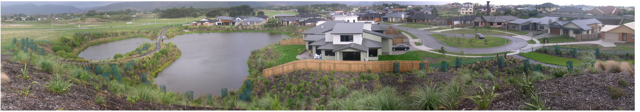
View east from Dune lookout