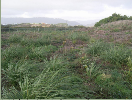
Initial planting in Stage 4, September 2006.