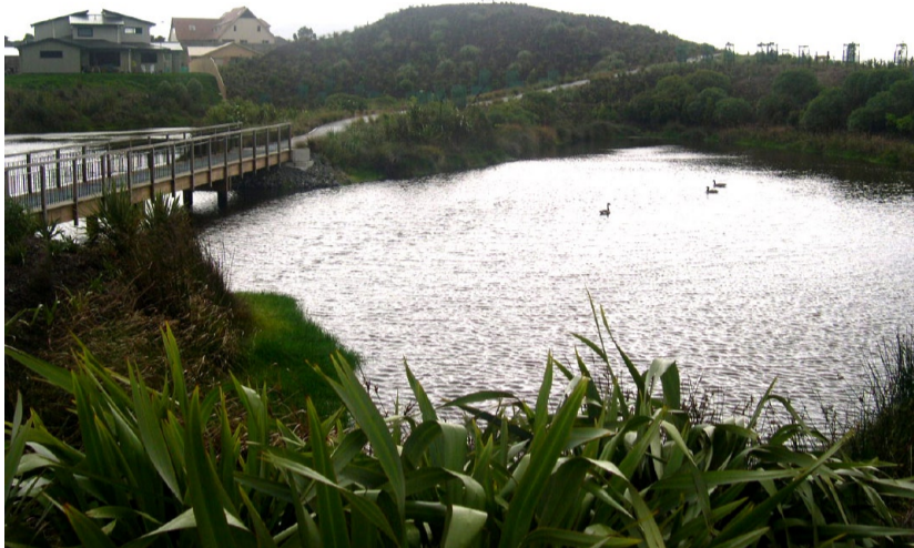
View over Kotuku Lake to Dune Lookout