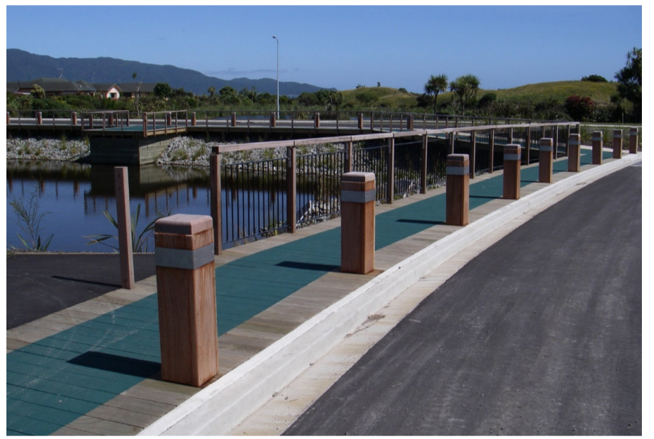
Boardwalk around detention pond