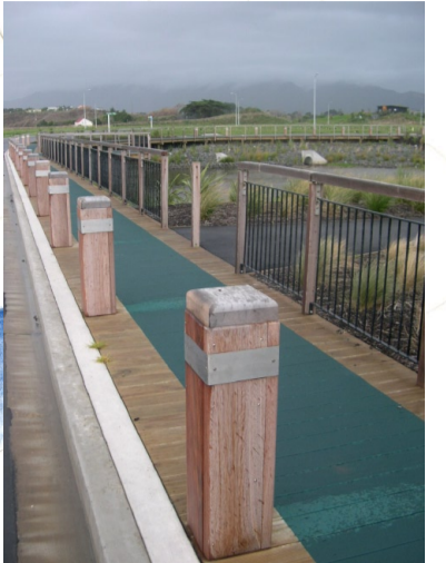
Boardwalk at detention pond