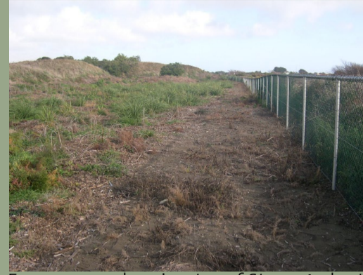
Fence around perimeter of Stage 4 planting