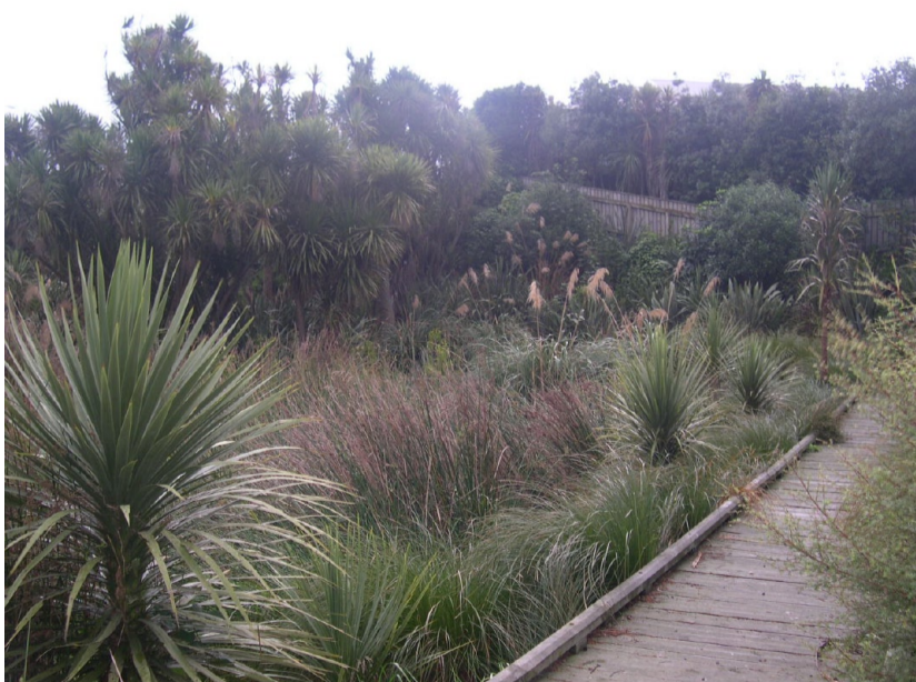
Boardwalk through Arapawhiti Cemetery Reserve