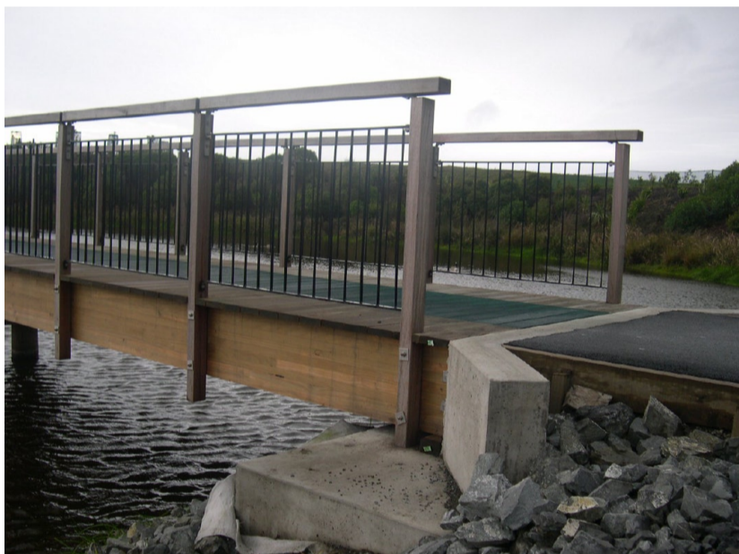
Bridge detail over Kotuku Lake