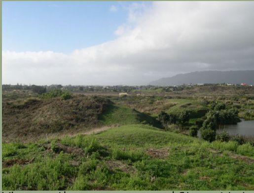
View north across proposed Stage 4 Lots