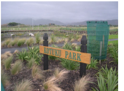
Kotuku Park entry signage